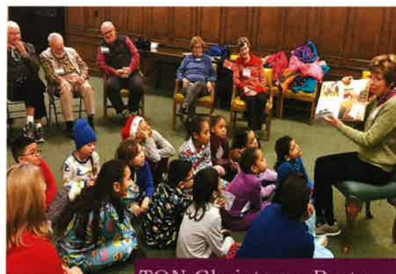
TON Christmas Party

If we overlooked your birthday, or you would rather we didn't put your birthday in the First Press newsletter, please call the office and let us know.