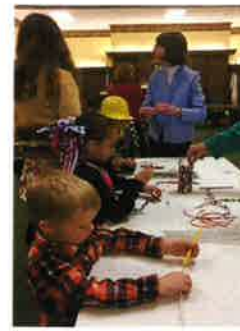
Constructing First Sunday of Advent

"Lent stimulates us to let the Word of God penetrate our life and in this way to know the fundamental truth: who we are, where we come from, where we must go, what path we must take in life..." -Pope Benedict XVI